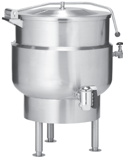
Model K20DL shown with optional 2" plug valve